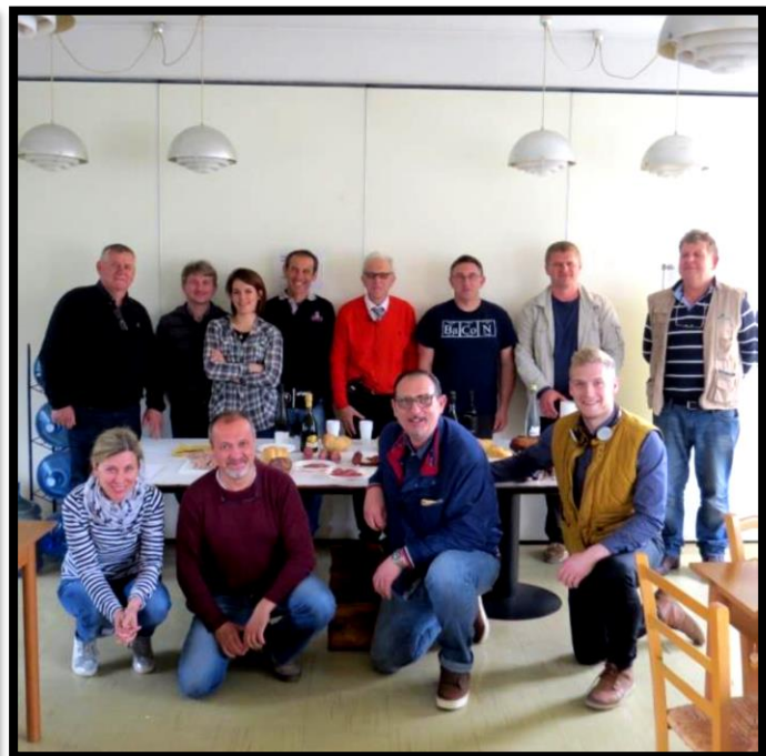
During the lessons