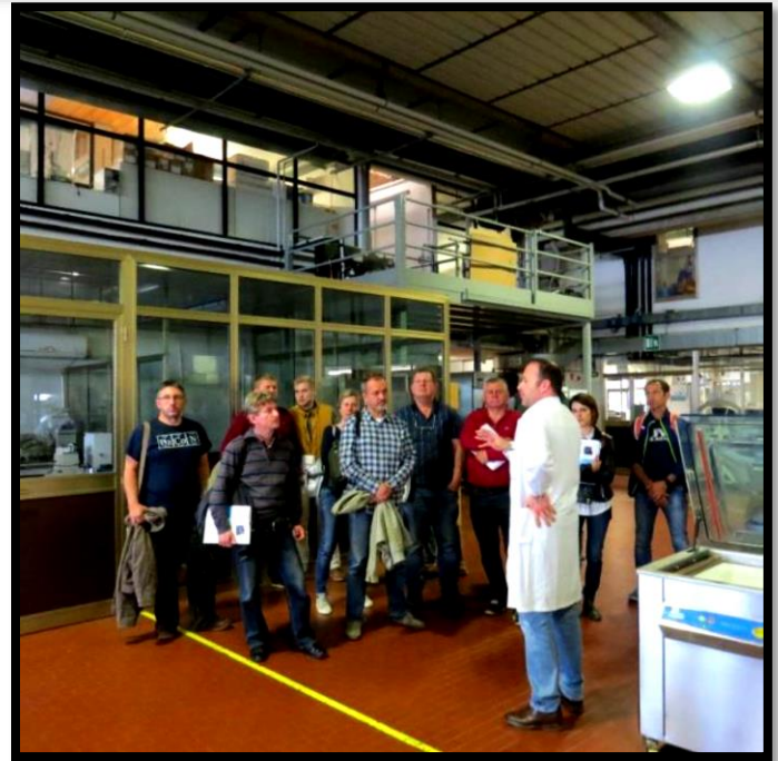
SSICA pilot plant and laboratories